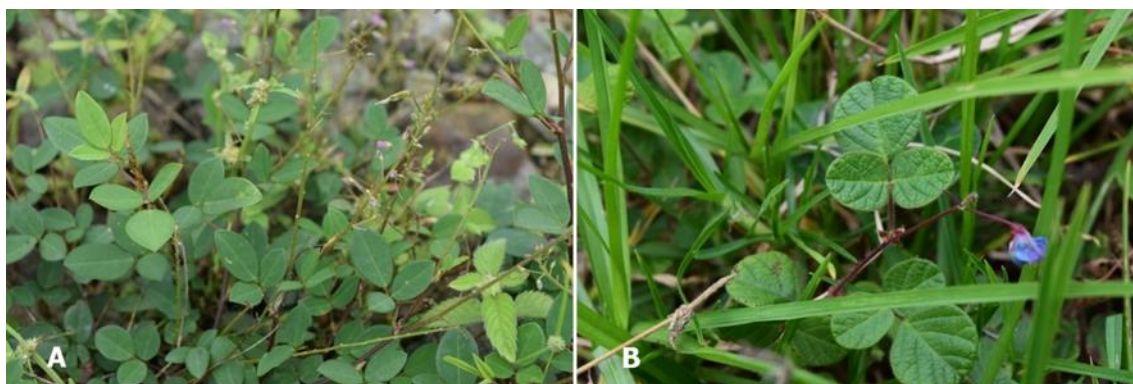
Figure No. 2

The symbol - indicates the absence of information, the symbol * indicates that the chemical name of the secondary metabolite is not reported