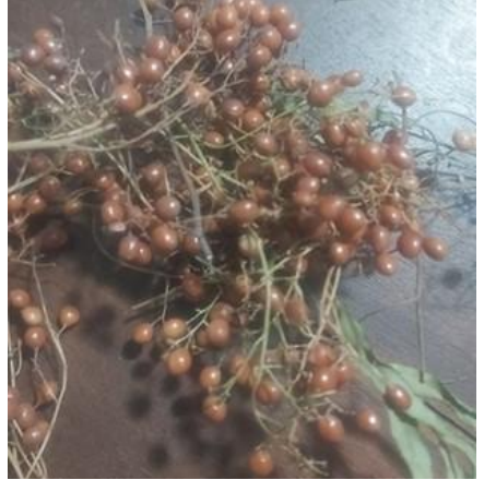
Figure No. 1 Schinus molle drupe

In this case its fruit is a small, spherical and reddish or brown drupe, with a spicy flavour (Figure No. 1)